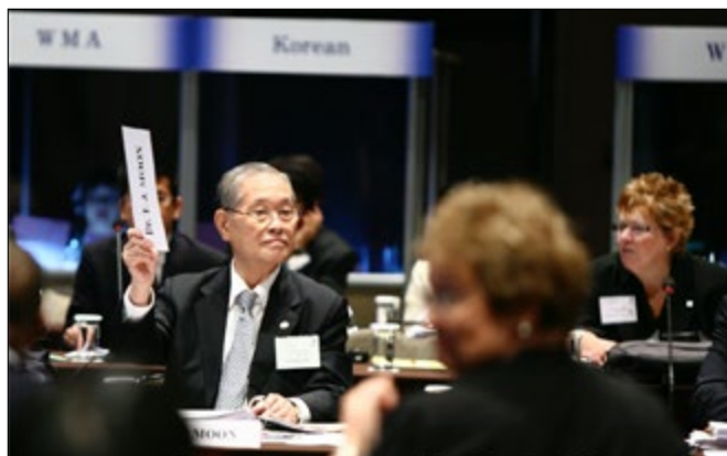
180 th WMA Council Session during the 59th WMA General Assembly, Seoul in 2008